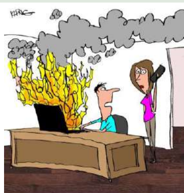
"Cancel that call to tech support. This may be beyond their capabilities."